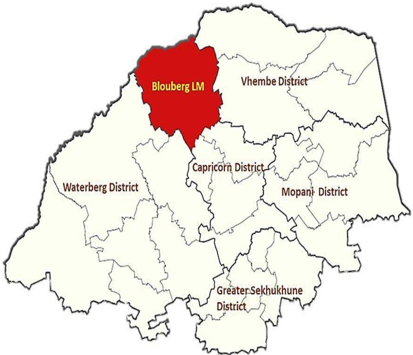
Map 1) Map of the Limpopo Province depicting the location of Blouberg Municipality within the Limpopo Province