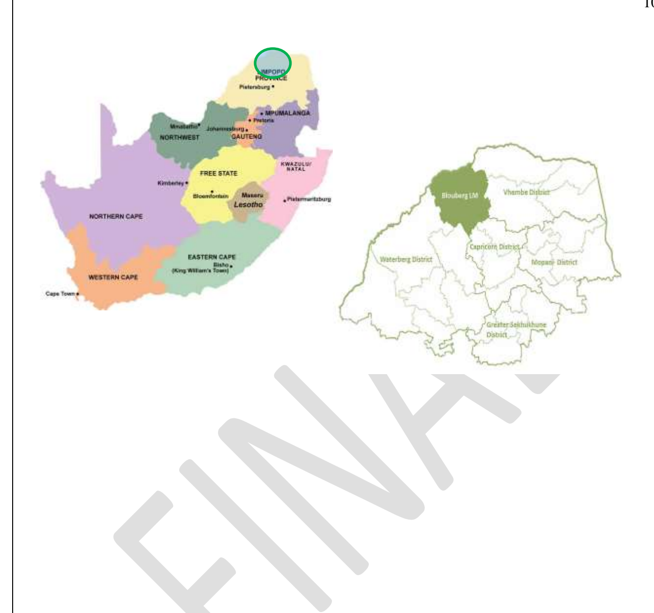
Map 1) Map of South Africa and Limpopo Province depicting the location of Blouberg Municipality within the Limpopo Province, in particular, and the country, in general.