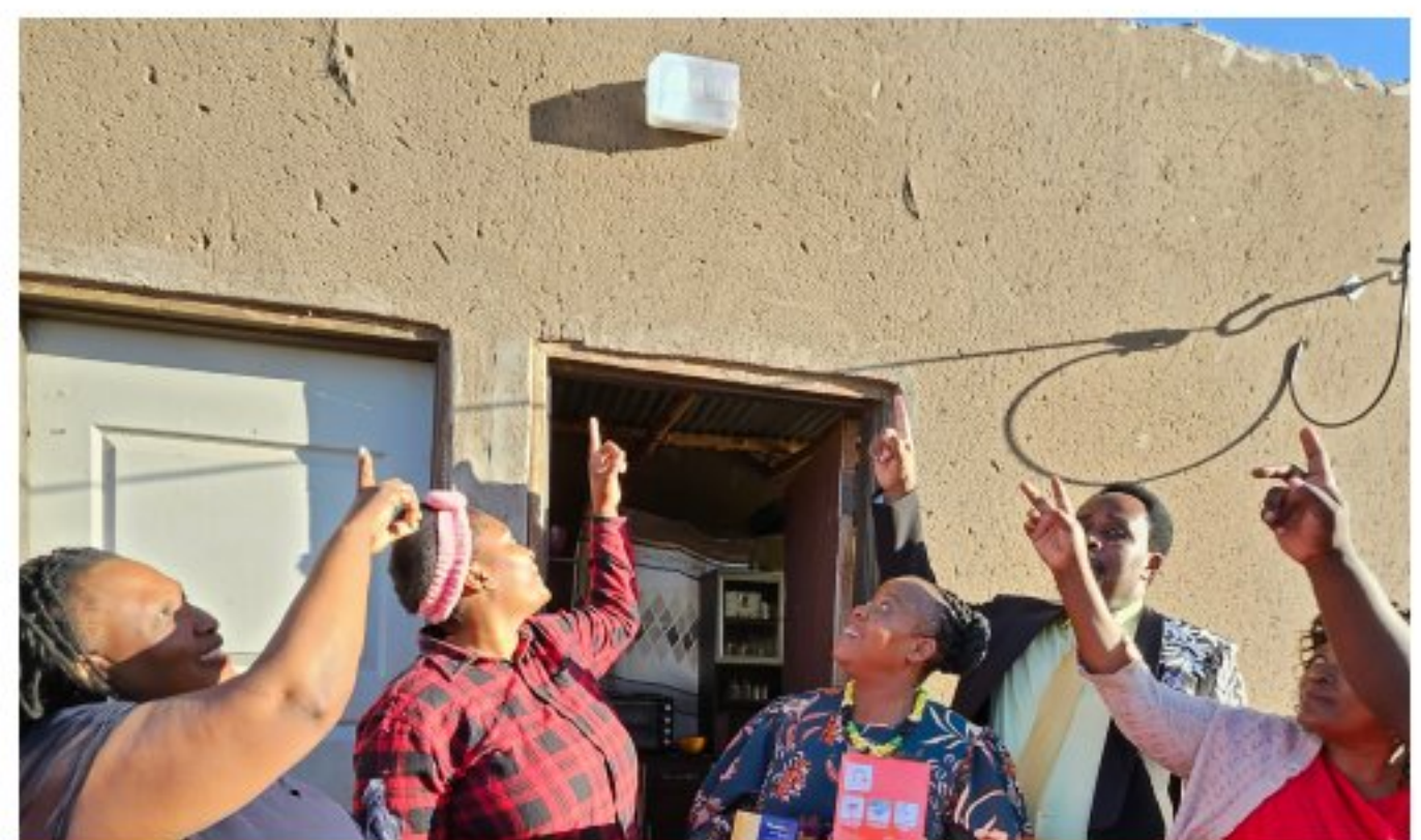
Mayor Maria Thamaga officially switches on the completed Witten Ext 10 electrification project at Matema household.

The Mayor extended her gratitude to the project steering committee, ward committees and the Ward Councilor for ensuring that the project runs smoothly until the end.