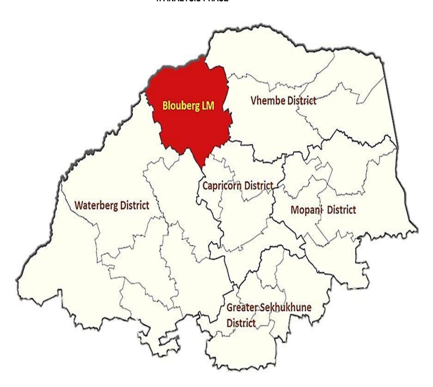
Map 1) Map of the Limpopo Province depicting the location of Blouberg Municipality within the Limpopo Province