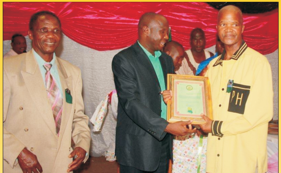
Receiving mementos from the Mayor are recently retired municipal employees (in other words you wrote the man instead of Mayor and employee instead of employees).

When the day was done, everybody went home with hope and excitement that Blouberg Municipality had entered a new era.