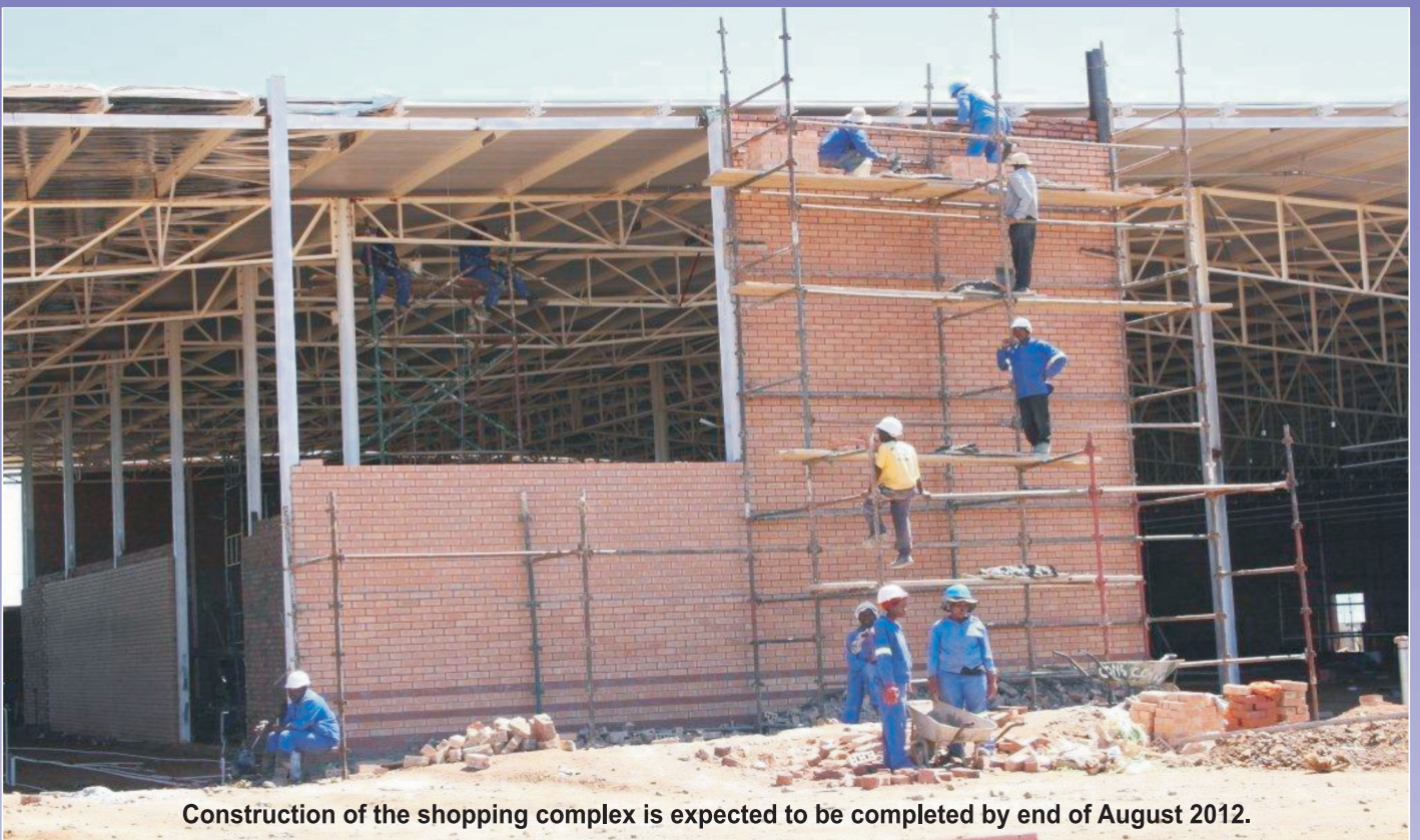
Construction of the shopping complex is expected to be completed by end of August 2012.