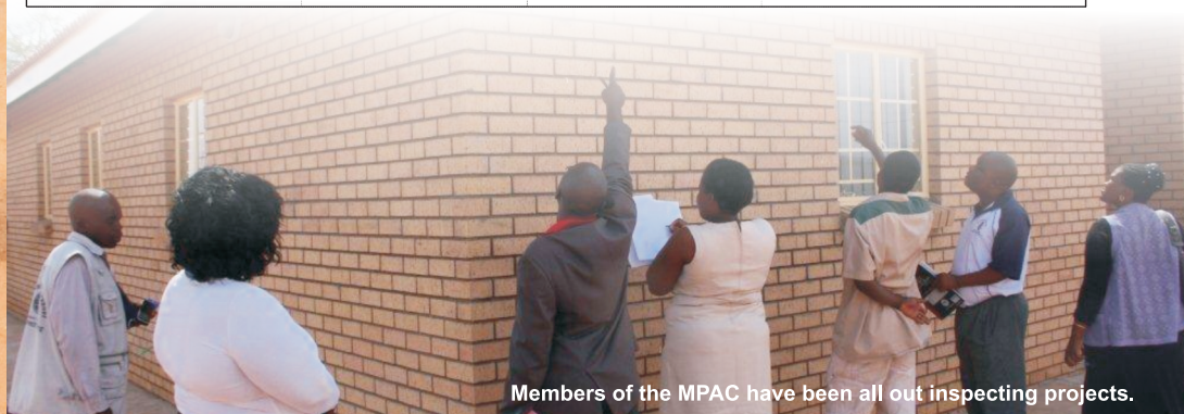
Members of the MPAC have been all out inspecting projects.