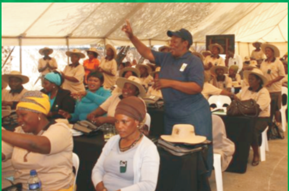
The mood of the 8th Ward Committees Conference