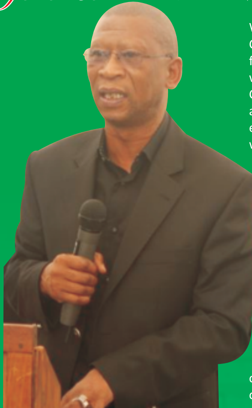
Executive Mayor, Cllr Mapoulo addressing the 8th Ward Committee Conference of Blouberg Municipality

Delivering the keynote address the newly elected Capricorn District Executive Mayor, Cllr Lawrence Mapoulo, succinctly captured the aspirations and mood of the Conference as he said “It is our belief that this forum reaffirms the reality that the greatest treasure of any nation is its people; and that the greatest asset of any democracy is the participation of its people in shaping their own future and that of their country; and further that true freedom can only be realized when our people are taking charge and full responsibility for their own destiny.” The Executive Mayor committed to continue working with Blouberg Municipality to come up with cost effective ways of