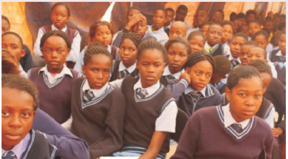
The next generation of scientists, thanks to BOSTEC

Giving a keynote address, The Mayor of Blouberg Municipality, Cllr Serite