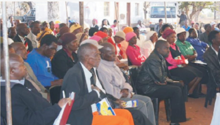
Part of members of the public who attended the recent Council meeting at Montz

The only intervention necessary was in respect of a few ward committees that had to be replaced in line with the dictates of the Ward Committees Constitution. It is important that ward committees remain apolitical and continue to serve their communities with the integrity that has always characterised them.