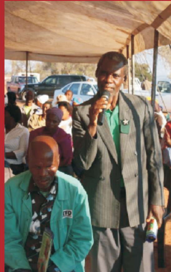
Blouberg communities have a say in the affairs of their Municipality

The Mayor lashed at the illegal occupation of municipal land in Desmond Park