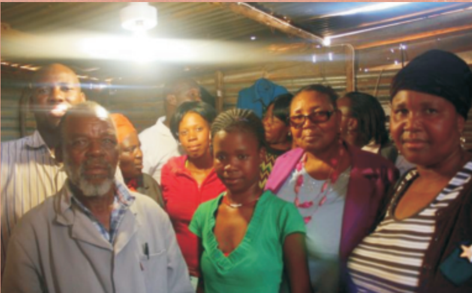
There's light all over Blouberg, thanks to Operation Leswiswi o kotsing