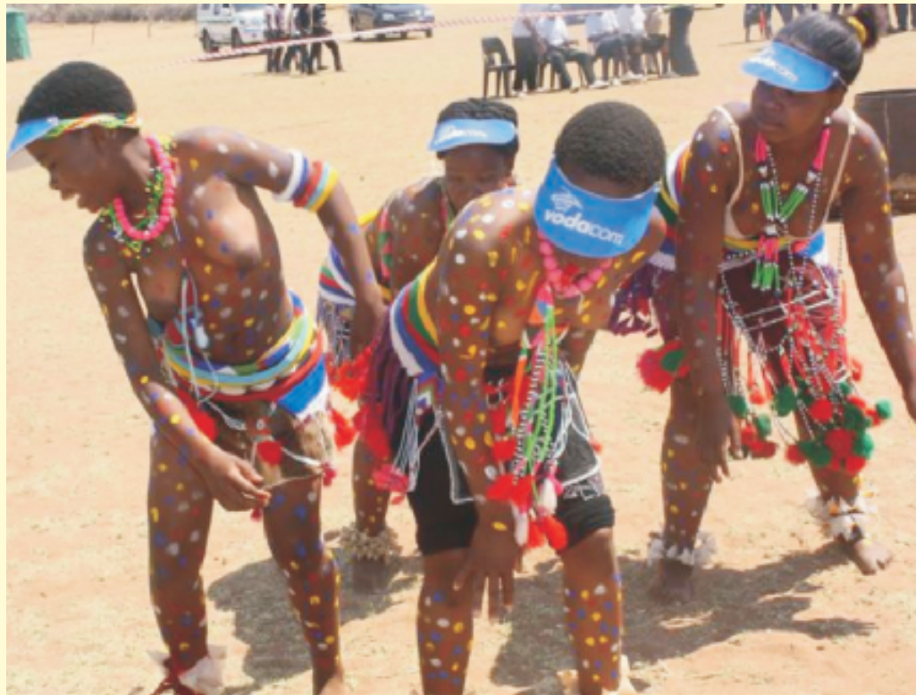
Some of the cultural riches that were displayed at the 2010 Maleboho heritage celebration

The struggle of Bahananoa and Malebogo began way back when the two Boer republics where founded, namely the Zuid Afrikaansche Republic (ZAR / Transvaal) and the Orange River Sovereign (later Orange Free State.) Within these Boer republics, just like in all other parts of South Africa, there were independent Black Traditional authorities which until then enjoyed their freedoms.