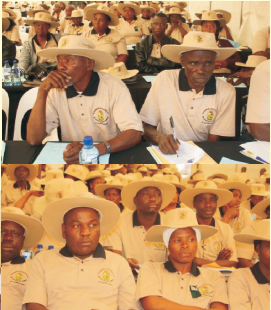
The 8th Ward Committees Conference through the eyes of the photographer