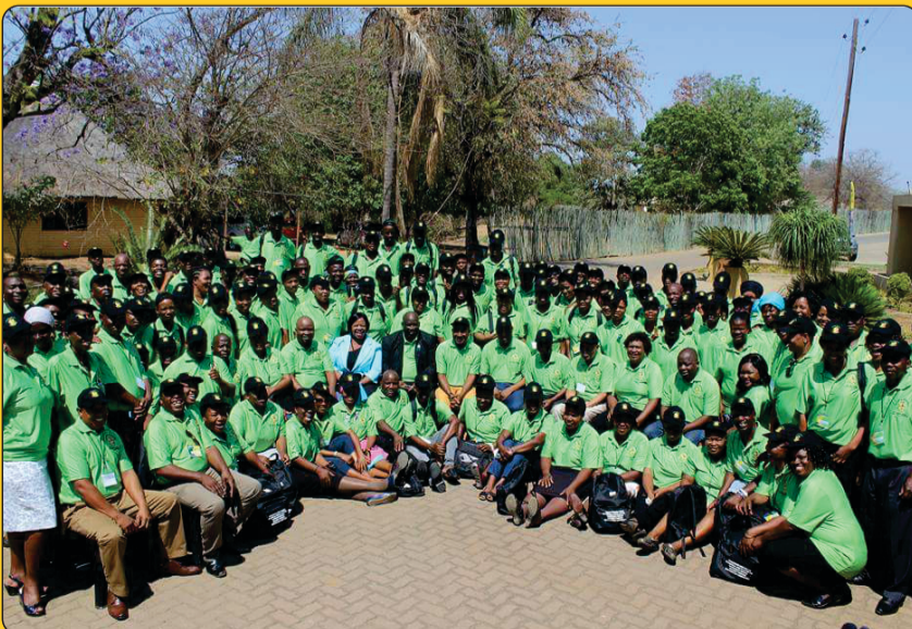
Ward committees pose with the leaders following an exhausting induction programme

W e, the people of Blouberg gathered at Karibu Leisure Resort in Tzaneen from the 28th – 30th October 2016 under the theme: “Capacitating new cadres of a special kind in an effort to enhance service delivery through participatory democracy”, as Councillors, members of Ward Committees, representatives from Sister Municipalities within the Capricorn District, Magoshi, CoGHSTA, CDWs from our 22 wards across the municipality, senior managers as well as other officials.