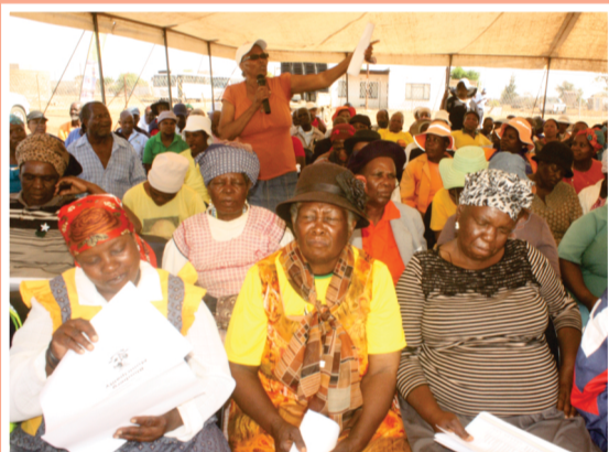
Residents seeking assurance from Blouberg Municipality following their relocation from the diestablished Aganang Municipality

The communities of the defunct Aganang Local Municipality, some of whose villages fall within Ward 21 and 22 of the Blouberg Municipality heeded the municipal leadership call to attend the 2016/2017 Integrated Development Plan (IDP)/Budget public participation meeting. The consultations were held on the 25th & 26th October 2016 at Cooperspark and Mamehlabe respectively. Those were the community's first contact with the Blouberg Municipality leadership since the disestablishment of Aganang Municipality following the 2016 Local Government Elections in August 2016.