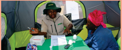
More farm workers and dwellers participated in the campaign in their bid to know their status