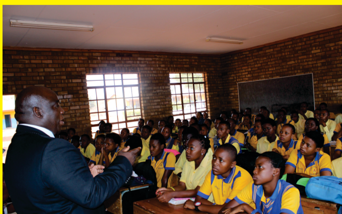
Mabea Secondary School learners listen attentively to Mayor Pheedi who undoubtedly still has that educator flair.

Learners were further urged to refrain from all sorts of misguided acts, wrongdoings and troubles that may waste valuable study time as the future, achievement of developmental goals and pride of Blouberg lies in the willingness of the young generation that is capable and prepared enough to work hard.