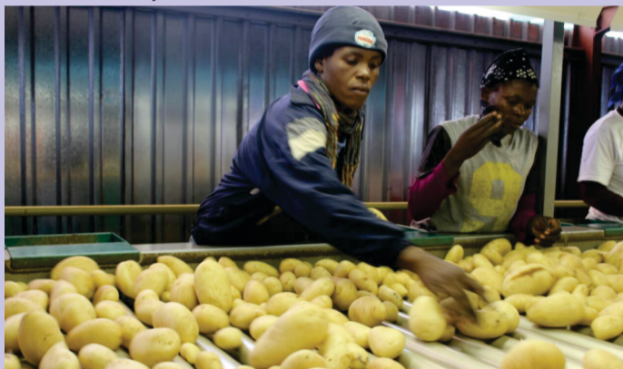
Farm workers busy preparing potatoes for exportation purposes.

Members of the public mainly small scale farmers from all corners of the province came in numbers to celebrate the day and grab the much needed information from the department. Community members who do not participate in any form of agricultural activities were urged to establish small gardens at their homes to produce vegetables. The MEC and the Mayor concluded the event by handing over food parcels to child headed families around the Marobjane area.