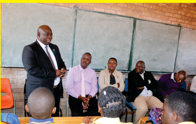
The inspiring message was sweet music to the ears of pupils, educators and officials alike