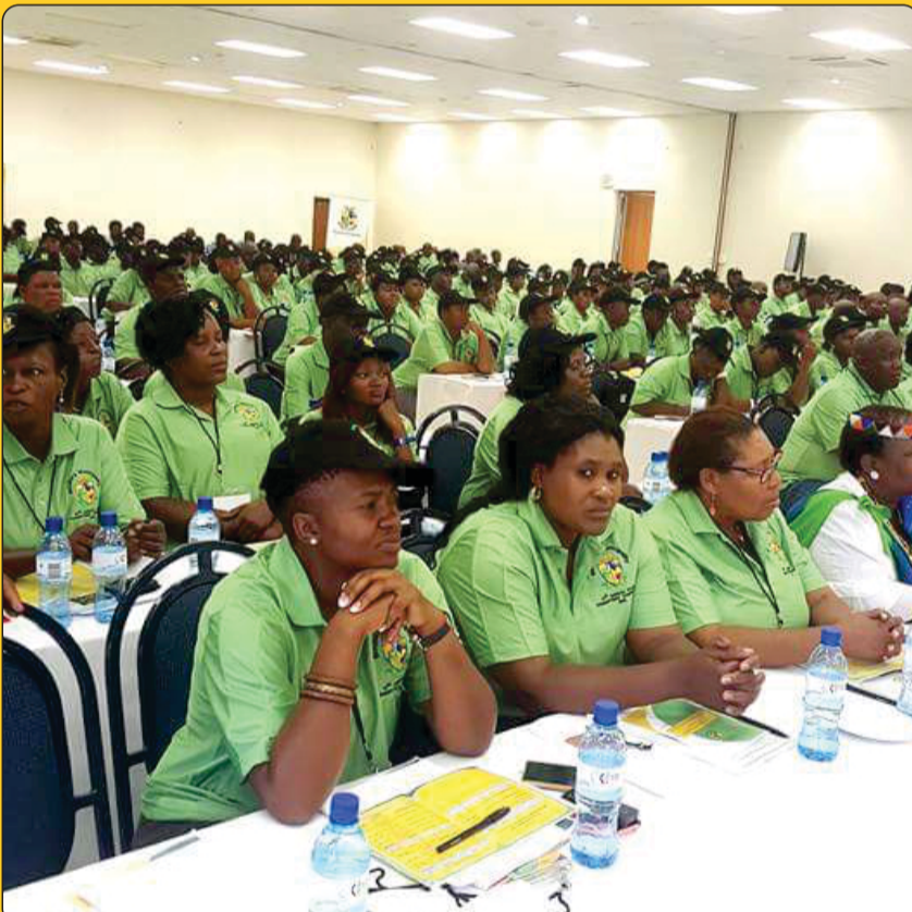
It was all glitz, glamour and hardwork as councillors, CDWs and officials convened for the 14th Annual committees conference