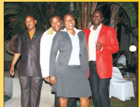
The gala evening