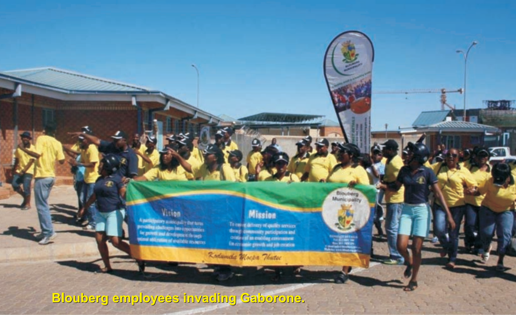
Blouberg employees invading Gaborone.

Botswana's Capital City, Gaborone, came to a standstill on the 23rd of October 2012 as municipalities from SADC countries paraded in the city's streets marking the official opening of the Southern Africa Inter Municipal Games (SAIMG).