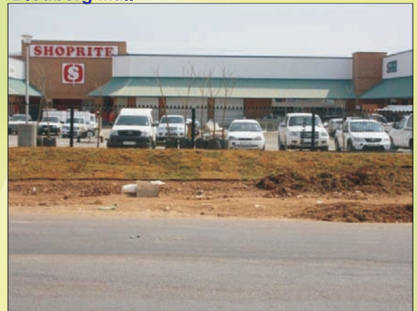
The new shopping mall at Senwabarwana.