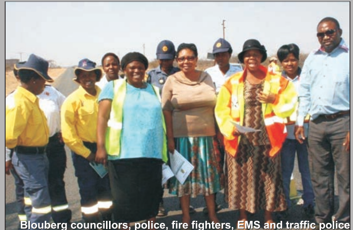
Blouberg councillors, police, fire fighters, EMS and traffic police have always found a good reason to work together to promote road safety.