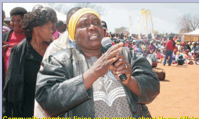
Community members lining up to enquire about Home Affairs services and to wish Dr Dlamini-Zuma success in her new role as the AU Commission boss.

The launch of the Stakeholder forum in Blouberg was preceded by a visit to the Blouberg Home Affairs Offices and Helena Frans Hospital before the delegation proceeds to Ga-Machaba to launch the Stakeholder forum.