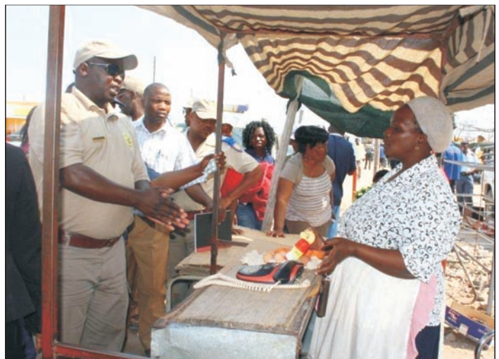
Municipal officials have vowed to continue to raid illegal street traders.