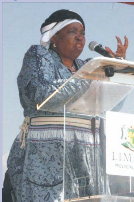
Dr Dlamini-Zuma leaves office on a high note in Blouberg.

A child must be registered with Home Affairs within 30 days. Marriages must also be registered. Women should avoid by all means getting trapped to illegal immigrants' tricks to marrying them in order to obtain citizenship. These are among the free lessons the former Home Affairs Minister (now African Union Commission Chairperson), Dr Nkosazana Dlamini-Zuma, came to dish out to the people of Blouberg on the 11th September 2012. Ga- Machaba Village was the place to be on the day and Blouberg people did not disappoint as they came in their numbers to the Minister's launch of Home Affairs Community Stakeholder Forum.