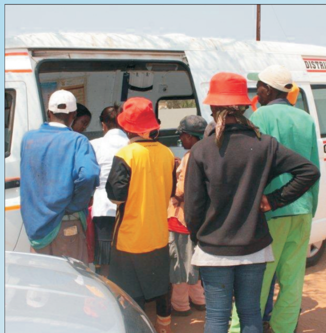
Farm workers filing to know their status, thanks to the Municipality's campaign.

sexual intercourse, contaminated blood transfusions and hypodermic needles, and from mother to child during pregnancy, delivery, or breastfeeding and it is the world's most significant public health challenge. However, with the advent of anti-retroviral therapy (ART), HIV positive people can now live longer and healthier lives. This has transformed the once life-threatening emergency to a manageable chronic disease.