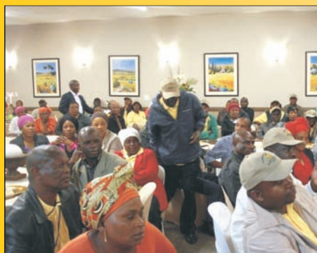
The gala evening